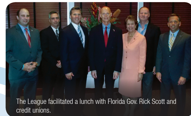
The League facilitated a lunch with Florida Gov. Rick Scott and credit unions.

Florida Credit Union Political Action Committee (CUPAC) is the LSCUs state registered political action committee (PAC). CUPAC makes contributions to candidates for the Florida Legislature and other statewide elective offices.